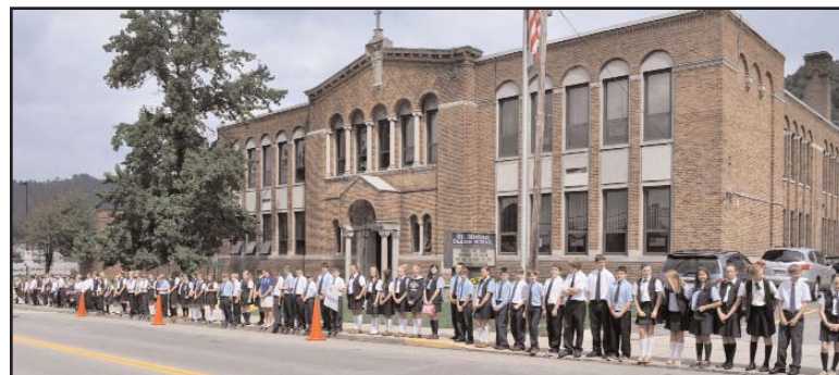
More than 200 students in grades 3-8 stood along National Road to participate in a silent prayer chain in remembrance of those lost on 9/11.

After the service, more than 200 students in grades 3-8 also participated in a silent prayer chain along National Road in remembrance of those who died.