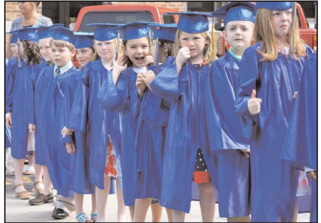
Excited kindergartners line up outside St. Michael Church in preparation for their graduation ceremony on June 1.

It was a day of caps, gowns, and blue/gold tassels as both our Kindergartners and 8th graders celebrated their graduations on June 1. In the morning, our 30 Kindergartners were all smiles as they entered the church for their special ceremony. After the program, family and friends were treated to a reception in the school hall.