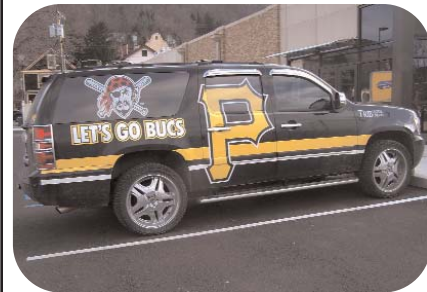
The Pirate Caravan visits SMPS