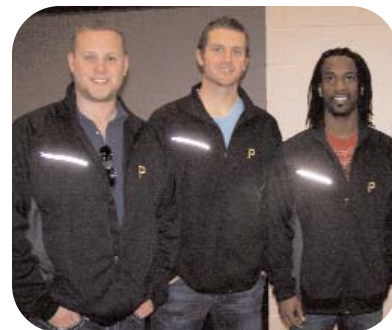
Pitcher Evan Meek, Pitcher Kevin Hart and Outfielder Andrew McCutchen of the Pittsburgh Pirates