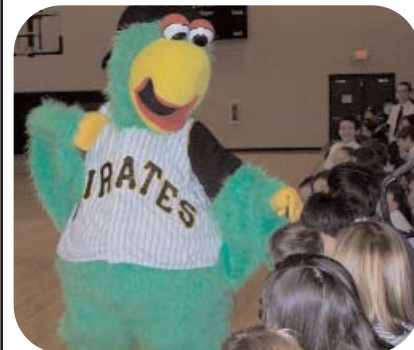
The Parrot has some fun with SMPS students