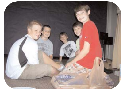
SMPS Sixth graders